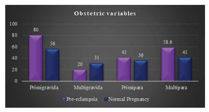
Figure 2: Distribution of obstetric variables between pre-eclampsia and normal pregnancy.

Table 2: Distribution of clinical variables among pre-eclampsia & normal pregnancy.