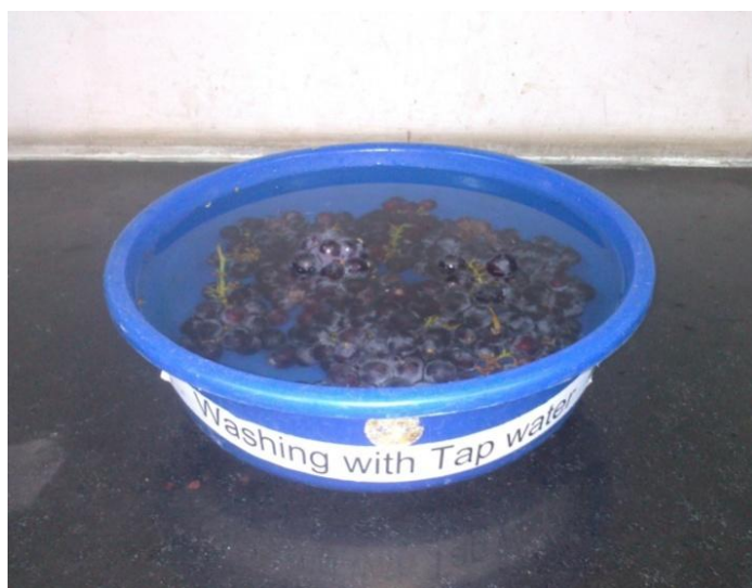
Fig 1: Tap water wash

Tap water: Results showed after decontamination of Grapes reduction of Dimethoate to 0.902mg kg -1 of 53.4 % over control , reduction of Chlorpyrifos to 1.241mg kg -1 of 28.0% over control , reduction of Quinalphos to 0.501mg kg -1 of 56.1 % over control, reduction of Profenophos to 0.696mg kg -1 of 49.8 % over control, reduction of Phosalone to 0.878mg kg -1 of 55.4 % over control, reduction of Lambda cyhalothrin to 0.978mg kg -1 of 43.0 % over control, reduction of Malathion to 0.079mg kg -1 of 50.9 % over control.